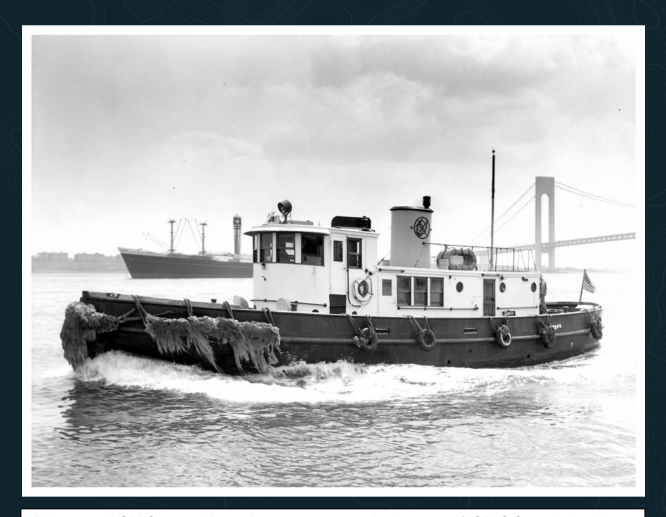
Early 1900s: USPHS cutter ship used to transport quarantine inspectors (USPHS Commissioned Corps officers) to board ships flying the yellow quarantine flag (symbolized by the use of this color in the flag of the USPHS). The flag was flown until USPHS Commissioned Corps officers and customs officers inspected and cleared the ship to dock at the port.

This Doctrine of the United States Public Health Service (USPHS) Commissioned Corps details our vision, mission, values, capabilities, and enduring nature as a uniformed service. It presents an opportunity for all who read it to develop a deeper appreciation for this unique and unrivalled national asset – the USPHS Commissioned Corps.