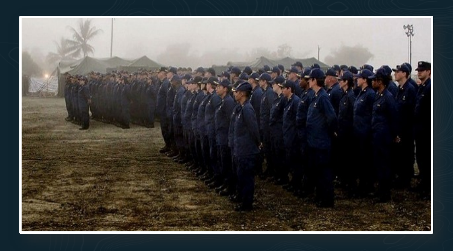
The USPHS Commissioned Corps stands ready ...